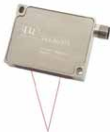
Laser Distance Sensors