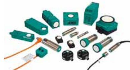
Ultrasonic Distance Sensors