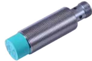
Non-Contact Proximity Switches

Pepperl+Fuchs Inductive, Capacitive & Magnetic Switches