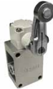
Mechanical Limit Switches