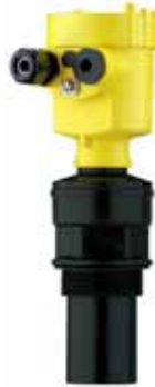
Ultrasonic Level Sensors