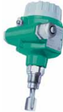
Vibrating Fork Level Switches