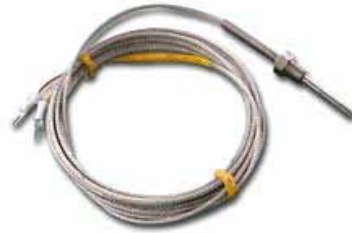
Thermocouple and RTD Sensors

Sensors, Gauges, Switches and Signal Equipment