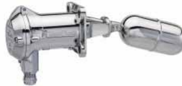
Side-Mount Float Switches