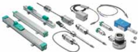
Linear Displacement Transducers