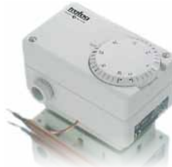
Switches & Thermostats