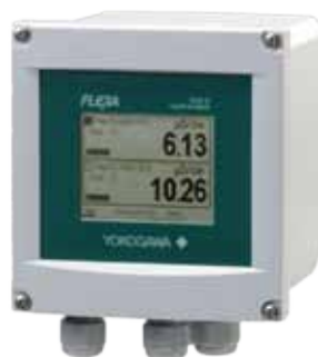
pH / ORP / Redox / DO

EE33 Remote Sensor Temp. And Humidity Transmitter