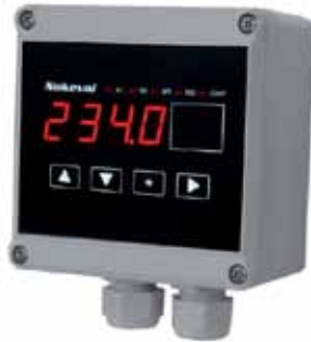
Indicators and Alarm Units

Nokeval 311 Field Indicator and Converter