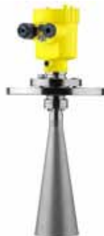
Radar Distance Sensors