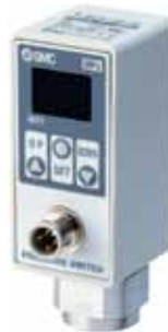
Electronic Pressure Switches

United Electric J400 Mechanical Pressure Switches