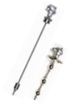
Guided Float Level Sensors