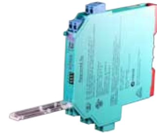
Intrinsically Safe Barriers