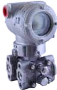
Hydrostatic Side-Mount Level Sensors