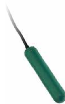
Float Level Switches