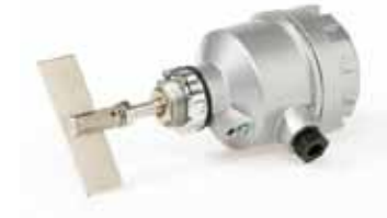
Rotary Paddle Switches