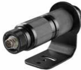
Infrared Temperature Detection