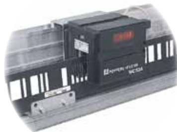
Absolute Position Encoding