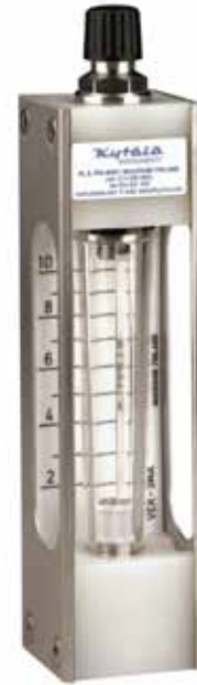
Variable Area Flowmeters

Yokogawa AXF Integral Magnetic Flowmeter