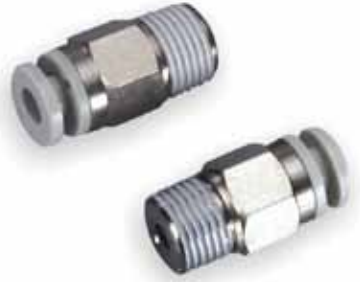
Push-Fit Tube Fittings