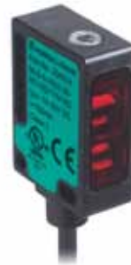
Optical Distance Sensors

Pepperl+Fuchs Inductive, Capacitive & Magnetic Switches