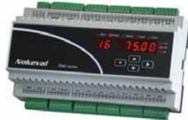
Signal Multiplexers and Remote IO