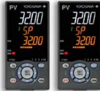
Temperature & Process Controllers

Nokeval 311 Field Indicator and Converter