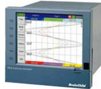
Recorders & Loggers