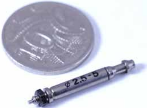
Air Preparation Equipment