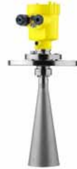
Radar Level Sensors

VEGAPULS radar level and distance transmitter