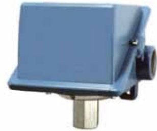
Mechanical Pressure Switches

United Electric J400 Mechanical Pressure Switches