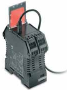
Programmable Signal Converters

Multiplexers take a number of signals in and are able to perform complex math or logic operations on them.