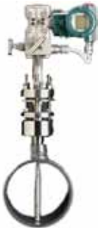
Averaging Pitot Tubes

Trimec DualPulse Insertion Paddle-Wheel Meter